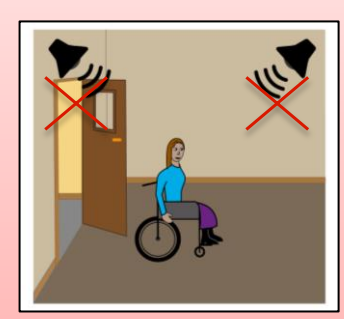
There should be a QUIET PLACE where you can wait so you do not feel anxious.

You can have an APPOINTMENT at a quieter or the best time of the day for you.