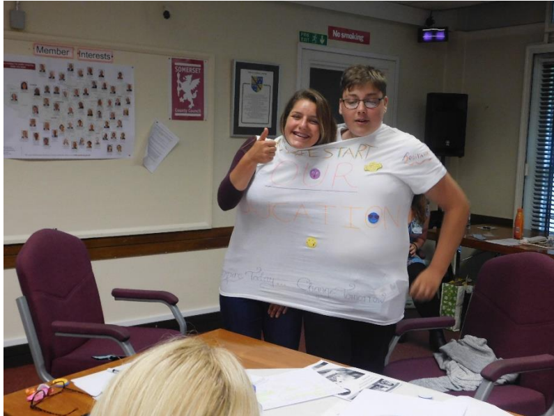
"Our Education. Inspire Today... Change Tomorrow"